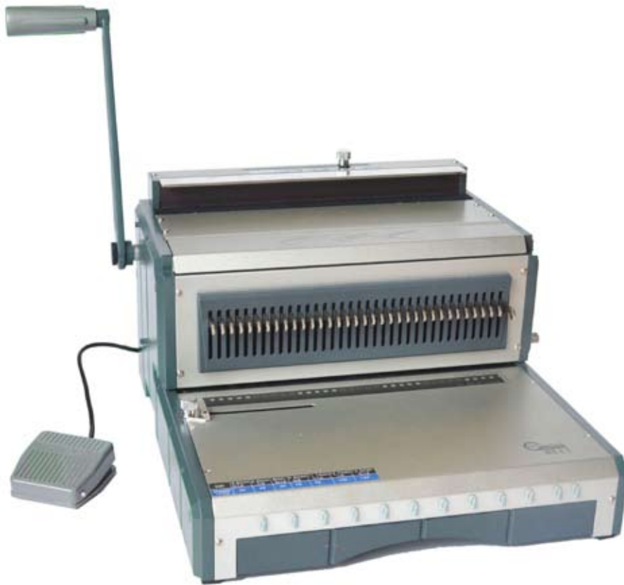
selectable punching pins