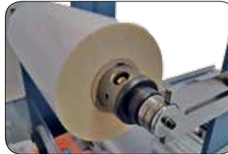
Pneumatic reel holder for easier loading and perfect film tensioning