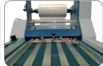
52cm width manual feeding with automatic overlapping