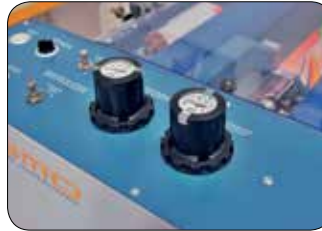
Professional pneumatic pressure system