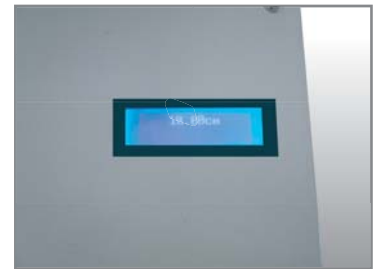
▲ manual backgauge with LCD display, LCD display with mm/inch (430D/480D)