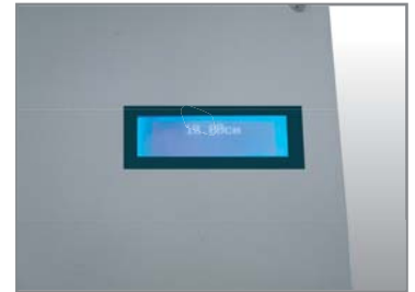
▲ manual backgauge with LCD display, LCD display with mm/inch (430D/480D)