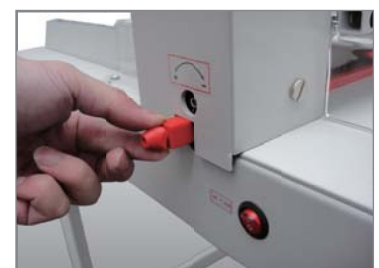
▲ Easy cutting stick change design