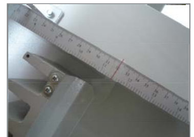
▲ manual backgauge with measuring scale, scale with mm/inch(430M/480M)